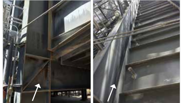
Box 1 column line which will support new grid

Contact Vogt Power International Aftermarket products at 1.888.VOGTPWR or email: aftermarket@vogtpower.com .