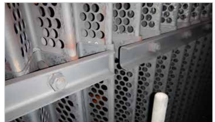
Close up of plate and channel interface, illustrating the sliding connections and range of movement