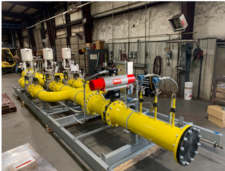
Flow Control Skid