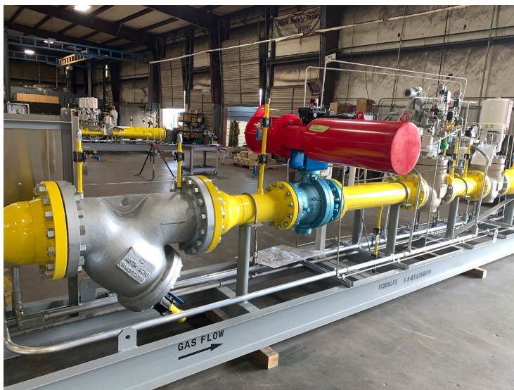
Pressure Reducing Skid

SAFETY ® PEOPLE. POWER. PROJECTS. We're giving safety the third degree.