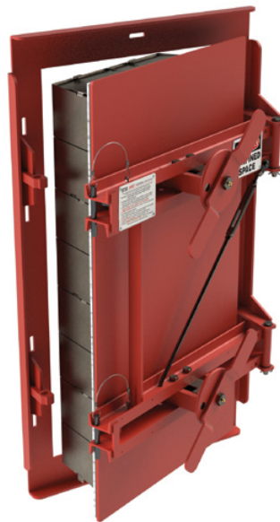
Imtec Insulated Single Door Without Tube Panel

The FLEXISEAL doors have one or more yokes with closing screws that act on center point(s) of the door. This flexes the door plate toward the interior and assures a tight seal with the gasket. When opening the door, special safety features in the latch and screw mechanism(s) will assure that the latch pin cannot be removed easily until the door plate with its gasket is safely retracted from the sealing surface on the frame plate, thereby revealing any dangerous internal pressure and also preventing damage to the gasket.