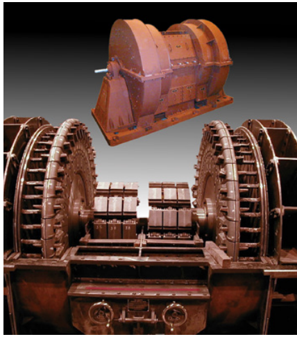
Easy Access for Maintenance

SAFETY<sup>3</sup> PEOPLE. POWER. PROJECTS.