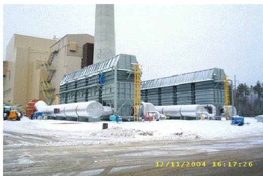
Figure 7: An RSCR system showing two trains of 5 canisters each.

See figure 6 for the first 15 MW unit under construction showing the catalyst in two canisters and thermal media in one canister. Figure 7 shows the completed system for a 50 MW boiler in which two trains of 5 canisters each were used to meet the emission reduction requirements.