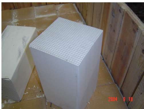
Figure 3: A block of monolith ceramic thermal media

A burner is required to compensate for the small inefficiencies in heat recovery and to make up for heat loss through the walls of the RSCR. The burners are located in the headspace of the RSCR in the retention chamber. The number of burners required is one less than the total numbers of canisters. Therefore, one burner is required for a two-canister system. View ports are provided in the retention chamber for visual inspection of the burners (see Fig. 4).