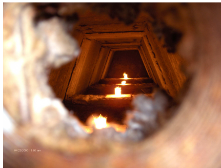
Figure 4: Photo of RSCR system burners in operation.

A small fan is required to supply combustion air for the burners. During the start-up process, the burners help bring the system to the desired operating temperatures from the cold condition. The burners can be designed to use natural gas, propane, low sulfur fuel oil, or biodiesel, depending upon specific plant requirements. The retention chamber and canisters are internally insulated to minimize skin temperature for a given ambient temperature and wind speed. Skin temperature generally does not exceed 120°F.