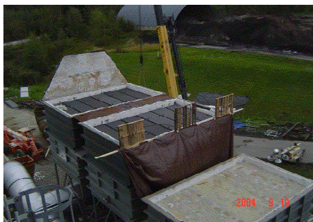
Figure 6: A three-canister system under construction.

The inlet NO x levels at the sites are typically in the range of 0.25 to 0.28 lb/MBtu. While designed to reduce NO x levels by 70 to 75%, the two systems have been able to reduce NO x levels significantly below 0.075 lb/MBtu. Because the RECs are based on reductions averaged over the quarter and not on instantaneous values the plants are able to “catch up” their averages should the RSCR be out of service for any reason.