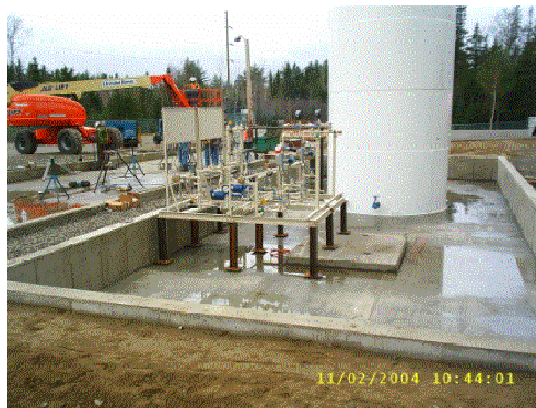
Figure 5: Ammonia skid/storage tank -50 MW RSCR.

The ammonia delivery system consists of ammonia pumps, storage tank, interconnecting piping and a control system (See Figure 5). The size of the tank depends upon injection rates, hours of operation and typical delivery truck volume. The small, redundant ammonia pumps use a variable speed drive that can vary the quantity of ammonia in response to changes in NO x as detected by the plant CEMS monitor.