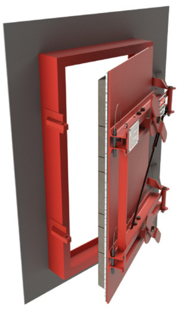
Imtec Boiler Door with Tube Panel

safety features in the latch and screw mechanism(s) will assure that the latch pin cannot be removed easily until the door plate with its gasket is safely retracted from the sealing surface on the frame plate, thereby revealing any dangerous internal pressure and also preventing damage to the gasket.