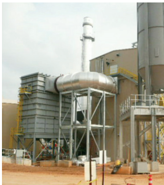
▲ ETEC's Hilton Lively Renewable Power Biomass Project in Woodville, TX

Babcock Power Environmental worked with Gemma Power Systems, LLC, and East Texas Electric Cooperative (ETEC) to supply the Riley Stoker boiler and air quality control system including an MPCR with a split air heater on a 50 MW biomass project for chipped forest waste in Woodville, TX. The Hilton Lively Renewable Power Project was a finalist and received honorable mention for 2015 Project of the Year Award by Renewable Energy World and Power Engineering. The performance levels surpassed specifications and the plant is one of the largest, most-efficient and sustainable plants of its type.