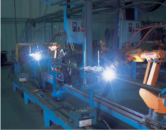
Weld Overlay Applied with Robotics