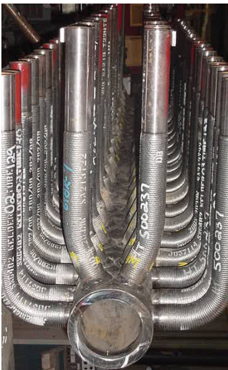
Weld Overlay Applied with Robotics