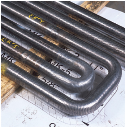
Overlaid Superheater Pendants

Boiler Tube Company of America, a Babcock Power Inc.® company, has been designing, fabricating and installing replacement pressure parts and components for boilers of all sizes and types since 1918. In 1997, Boiler Tube Company of America commenced providing spiral tube weld overlay for boilers that were experiencing erosion and corrosion problems with various pressure parts. Today, Boiler Tube Company of America is a leading supplier in the spiral tube weld overlay field and utilizes a state-of-the-art patented fully automatic weld overlay process that has eliminated many of the problems that plagued earlier manufacturers of this product.