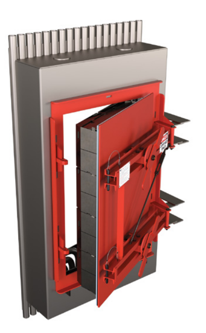
Imtec Boiler Door with Tube Panel